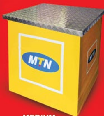
MEDIUM PROMO TABLE