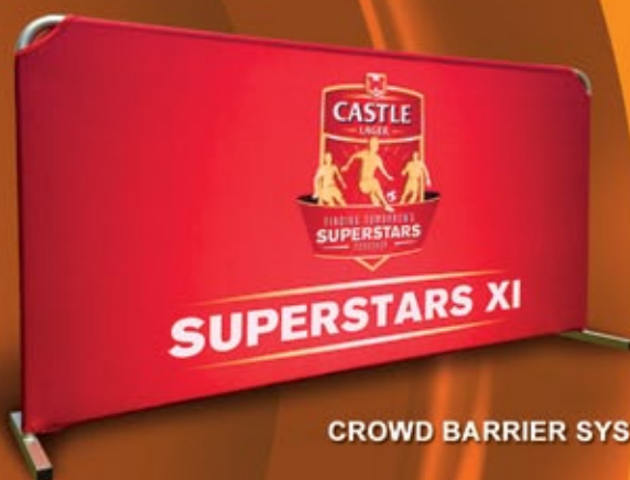
CROWD BARRIER SYSTEM