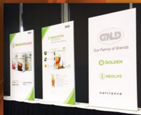
FABRIC FRAME SYSTEM