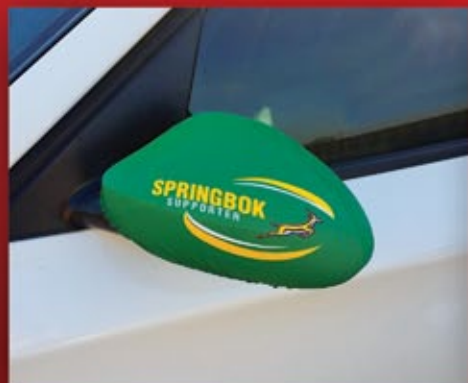
VEHICLE MIRROR SOCK