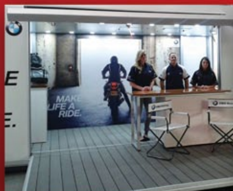
BMW MOTORRAD MSS