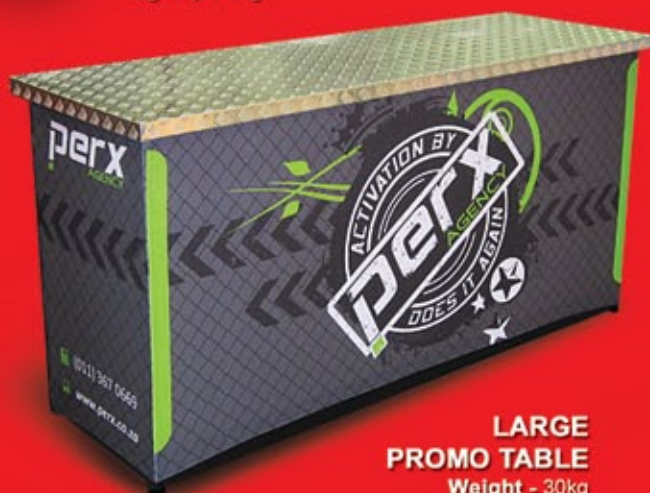
LARGE PROMO TABLE