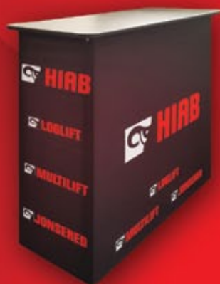
ECO PROMO TABLE

The ottoman allows for full digital printing.