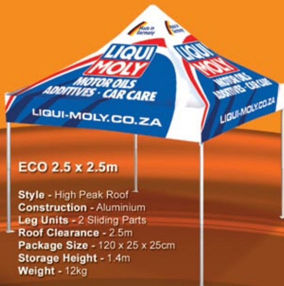
ECO 2.5 x 2.5m

Style - High Peak Roof Construction - Aluminium Leg Units - 2 Sliding Parts Roof Clearance - 2.5m Package Size - 120 x 25 x 25cm Storage Height - 1.4m Weight - 12kg