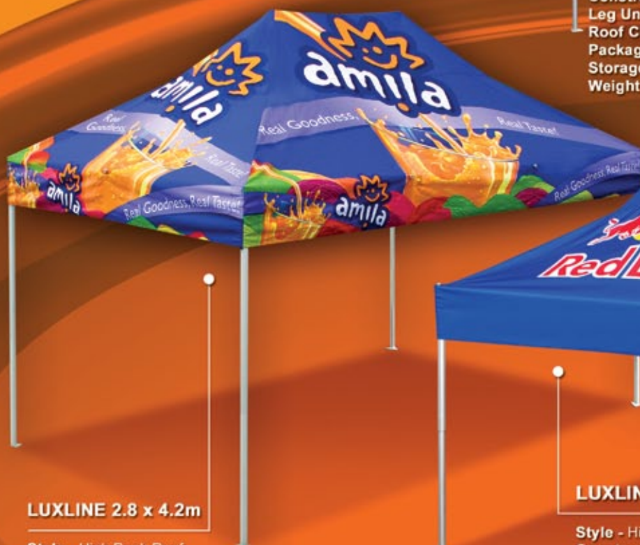
LUXLINE 2.8 x 4.2m

Style - High Peak Roof Construction - Aluminium Leg Units - 2 Sliding Parts Roof Clearance - 2.5m Package Size - 120 x 25 x 25cm Storage Height - 1.4m Weight - 12kg