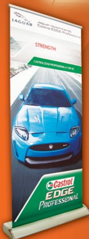
PULL-UP BANNER Size: 85,9 x 200cm