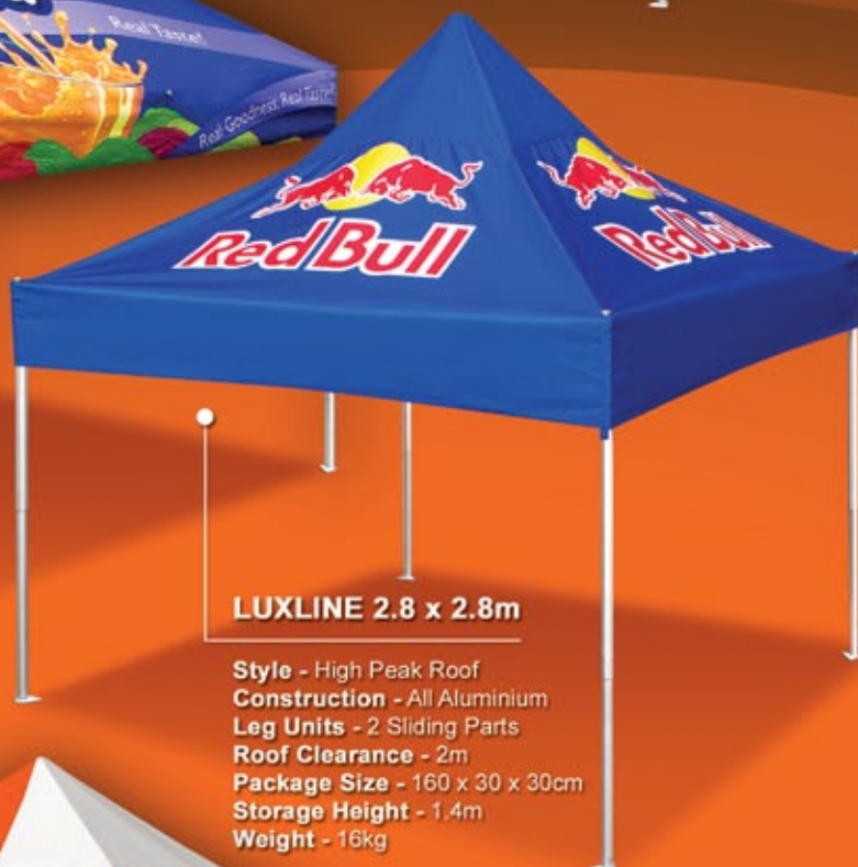
LUXLINE 2.8 x 2.8m

Style - High Peak Roof Construction - All Aluminium Leg Units - 2 Sliding Parts Roof Clearance - 2m Package Size - 160 x 40 x 30cm Storage Height - 1.4m Weight - 21kg