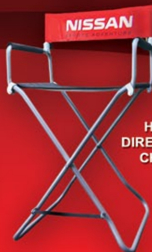
HIGH DIRECTORS CHAIR