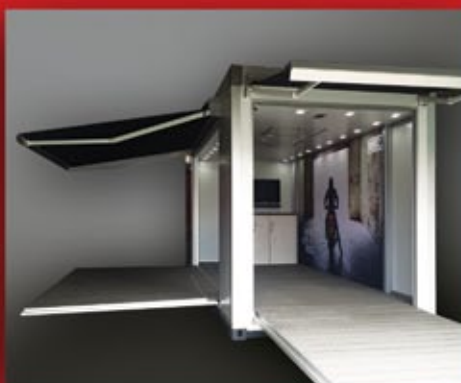
UNIQUE MOBILE STORE SYSTEM