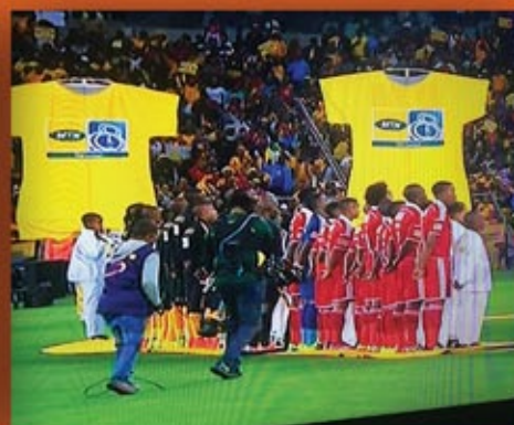
ANY SIZE CUSTOM FLAGS