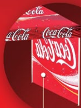
Full Wall [zips optional extra]