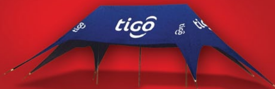
ULTRA SHADE 15m x 9m