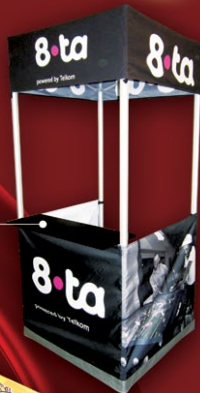
Table Shelf (included)

Style - Flat Roof Construction - Aluminium/PVC Leg Units - 2 Sliding Parts Roof Clearance - 2.1m Package Size - 120 x 15 x 15cm Storage Height - 1.4m Weight - 5kg/8kg